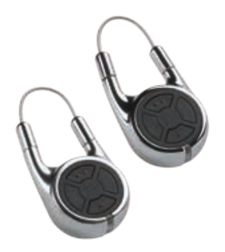
Designer 2-channel transmitter Aluminium look (fig. left) Bright chrome-plated (fig. right)

2 control button functions. Also usable as a key ring.