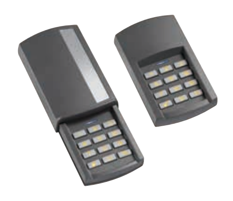
Wireless code switch With Slide Lid (fig. left)

In car transmitter plugs directly into your car cigarette lighter and can be programmed to open up to two garage doors.