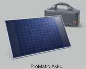
ProMatic Akku with solar module