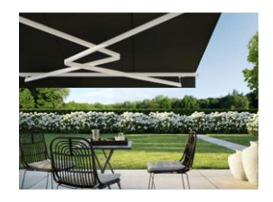
markilux 1700 stretch

Whenever you would like to enjoy life outdoors, the open design of the markilux 1700 will create comfortable shading on your patio or balcony. Its organic design is elegant and timeless, and thanks to the stable torque bar, it opens up the option of connecting up to three awnings together, making it possible to shade large areas without any problem. Enjoy the pleasant atmosphere this much openness brings.