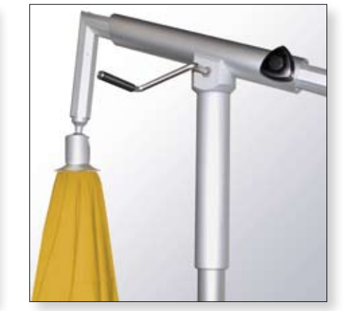
DK. DACAPO with crank