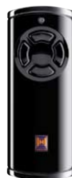
ProMatic Akku As standard with two black HSE 2 BS hand transmitters.

Operation period: approx. 40 days* Charging time: 5 – 10 hours** Weight: 8.8 kg Dimensions: 330 x 220 x 115 mm