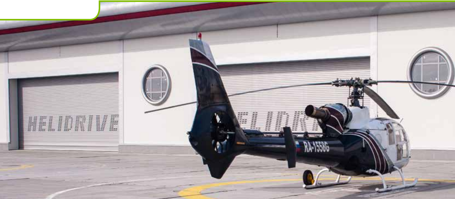
Use in hangar areas for helicopters.