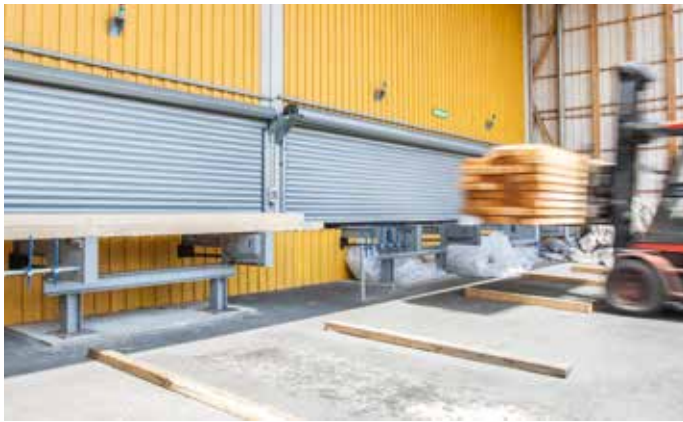
In the sawmill: Two rolling shutter doors offer sufficient room for the passage of extra wide lumber. They can also be integrated into the control systems of on-site conveyor systems.