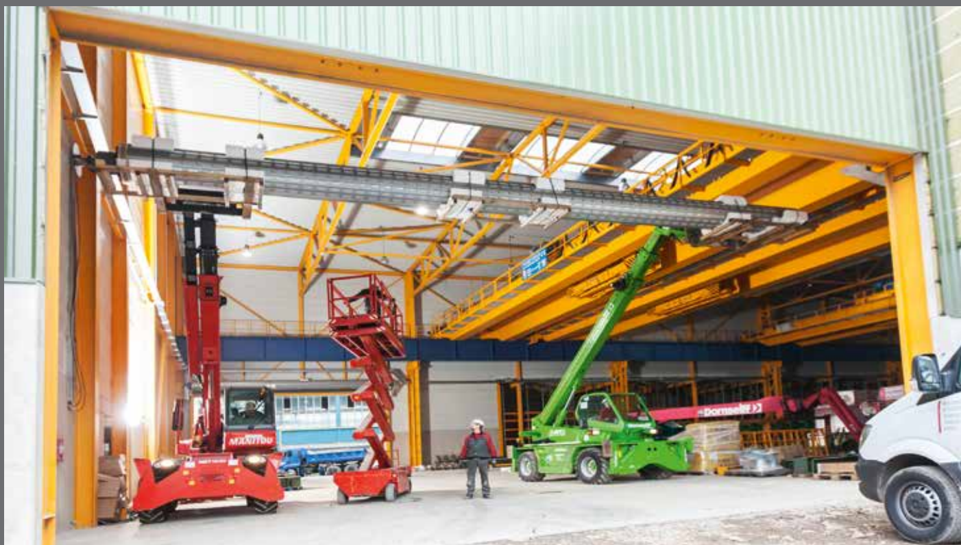
Thoroughly developed ideas from design to installation.