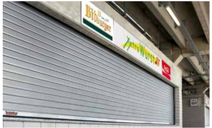
Special doors as snack bar shutters for the catering area in a football stadium.