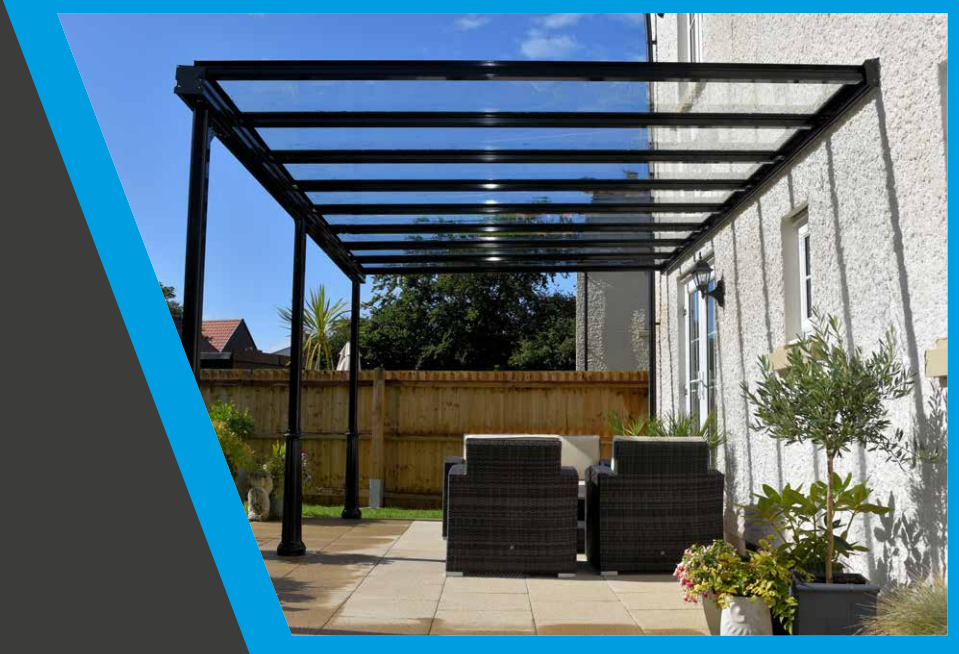
Victorian post upgrade