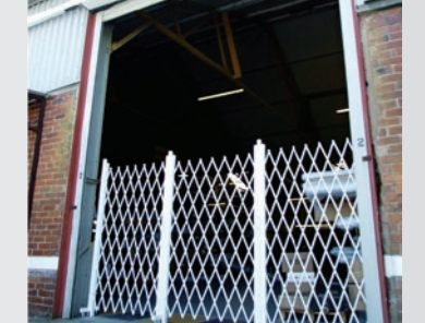
Closed Allows for ventilation whilst securing the opening.