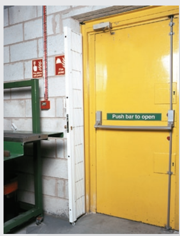
Folds away to leave opening clear