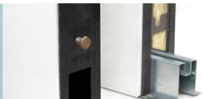
Mushroom pull knob system