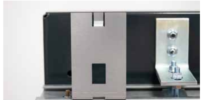
Suspension/feed for fascia panel

fastening elements and locking system) entirely behind the fascia panels. Thanks to this new system, the doors are not only particularly easy to install and maintain, but also score with an attractive appearance.