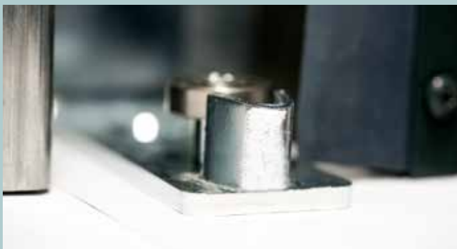
Illustration/view of lower guide

The new lower guide rail enables concealed mounting of the guide roller so that the door leaf guide is not visible. Since the guide roller is screwed to the counter feed, the position is predetermined, which prevents possible assembly errors. Further, there is no screw connection into the floor required.