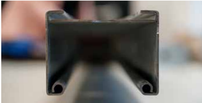
New tubular system

To ensure that our fire protection sliding doors do not only meet the highest safety requirements and design demands, but also meet the new European directives, we optimised our products accordingly. The fire protection sliding doors are equipped with a completely new tubular system, that conceals door technology (including