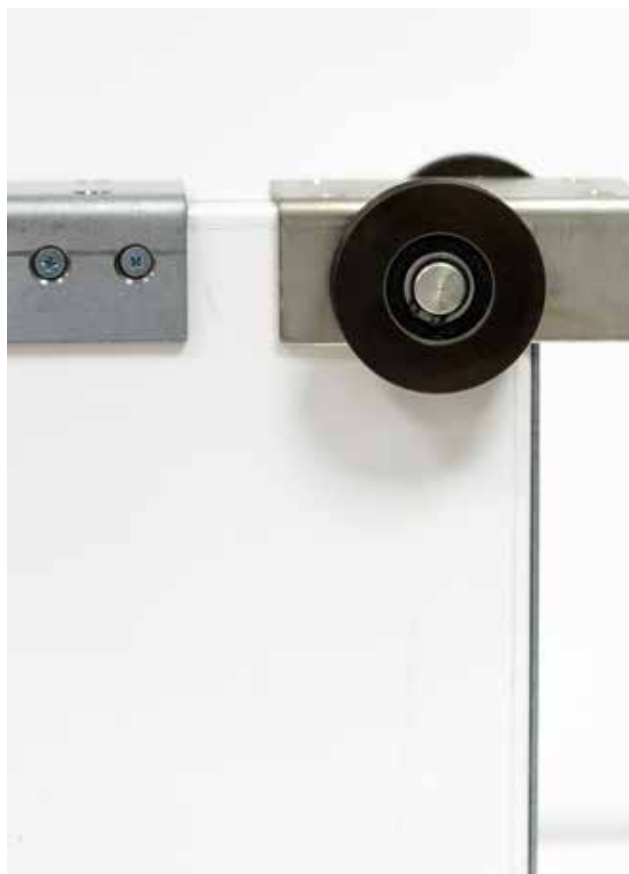
Door leaf in EI 2 30 version

No matter which fire protection sliding door you need: Our range offers solutions for all eventualities. You always benefit from first-class materials, precise workmanship, a long service life - and now, of course also from safety standards that are recognised throughout Europe.