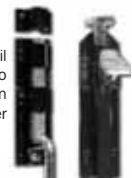
Foot activated bottom bolt also available in silver