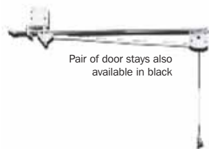
Pair of door stays also available in black