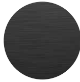
Scotch Brite Black