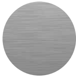
Scotch Brite Silver