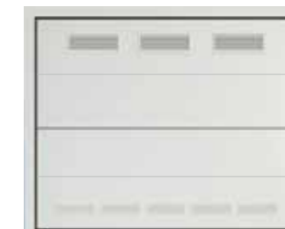
Overlap door, W 3270 x H 2580 with 3 rectangular ventilation grids in the upper panel and 5 rectangular ventilation grids in the lower one.