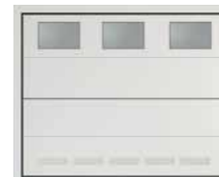
Overlap door, W 3270 x H 2580 with 3 windows and 5 rectangular ventilation grids.

Overlap is also available with a wide range of glazing options that allow you to illuminate the garage's interior with natural light and to lighten the visual impact of the door. The OVERLAP windows are made of polycarbonate, lightweight and durable material available with bronze embossed finish and, on request, clear embossed or smooth transparent finishes. If the garage needs ventilation it's possible to apply ventilation grids to OVERLAP.