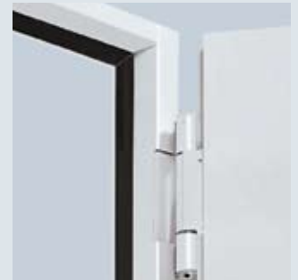
2-mm-thick corner frame with all-round seal

Hörmann also offers its MZ multi-purpose door with glazing. Due to security reasons, this glazing is kept very narrow, but it still lets you benefit from daylight inside. 7-mm wired glass is provided as standard, but 20 mm insulated wired glass with a view of 230 × 1360 mm is also possible. The natural-finish aluminium glazing frame is fastened on the opposite hinge side with glazing beads (optionally on the hinge side).