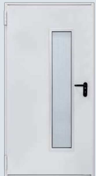
With glazing on request