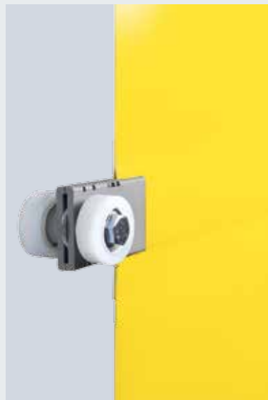
V 5030 SEL Spring steel wind lock for quiet door travel