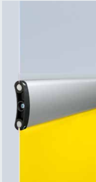
V 5015 SEL Curtain stability with aluminium profiles

Draughts always pose a particular challenge for doors. With the robust wind locks made of spring steel, the V 5030 SEL remains stable under small pull and wind loads. You can also optionally obtain the V 5030 SEL with aluminium bottom profile for wind class 1 (DIN EN 12424).