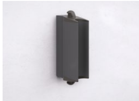
A broad range of fixture options markilux offers you the perfect means of installation for every situation.