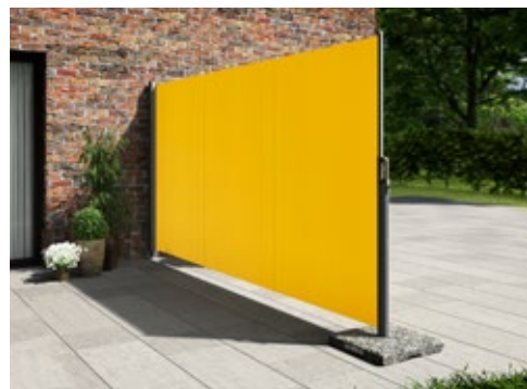
mobilfix The moving support post with granite base plate stands secure, wherever you want it to.