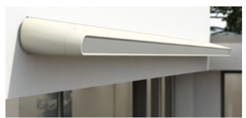
Colour combinations Cassette and front panel are available in different colours, which can be combined freely.