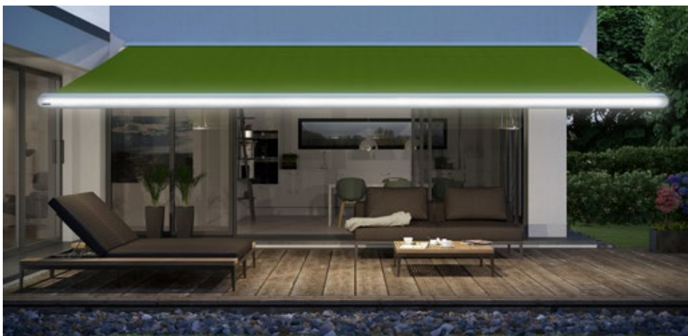
LED ambient lighting An impressive eye-catcher in the evening hours. The front profile is available in five contrasting colours and can be illuminated with dimmable lighting.