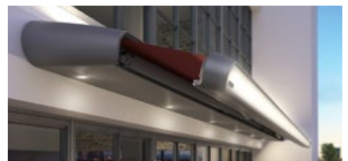
LED Spots in the cassette / canopy Highlight specific areas and allow you to enjoy a pleasant evening under the awning.