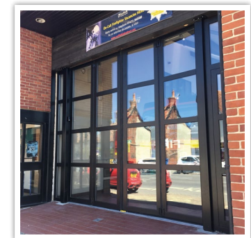
SWIFT SWT-E (FG)