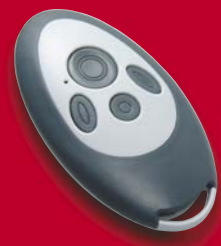
MIDI Hand Transmitter - 4 Channels

(one unit supplied as standard, additional Hand Transmitters available as optional extra)