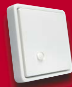
Wireless Wall Push Button - 2 Channels