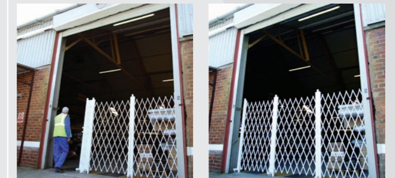
Open Allows for ventilation whilst securing the opening.