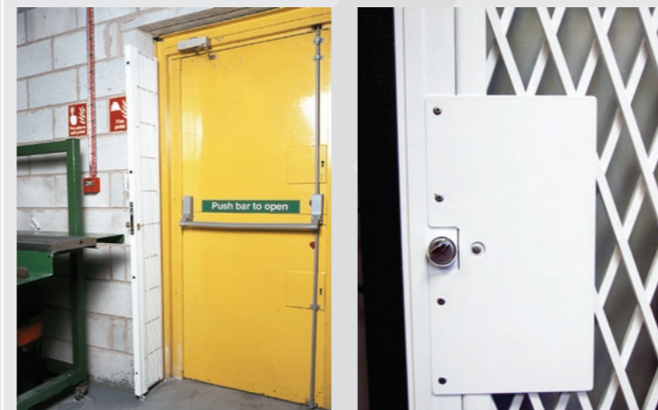
Folds away to leave opening clear