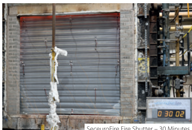
SeceuroFire Fire Shutter – 30 Minutes

The SeceuroFire Fire Shutters were tested and assessed by Warringtonfire. The product is fitted on the furnace side replicating the most severe condition and the temperature of the furnace is increased to 1200°C at a rate defined by the product standards.