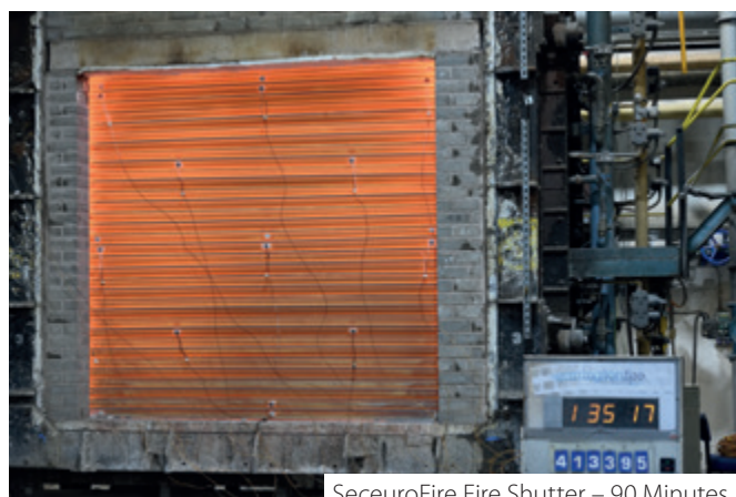
SeceuroFire Fire Shutter – 90 Minutes