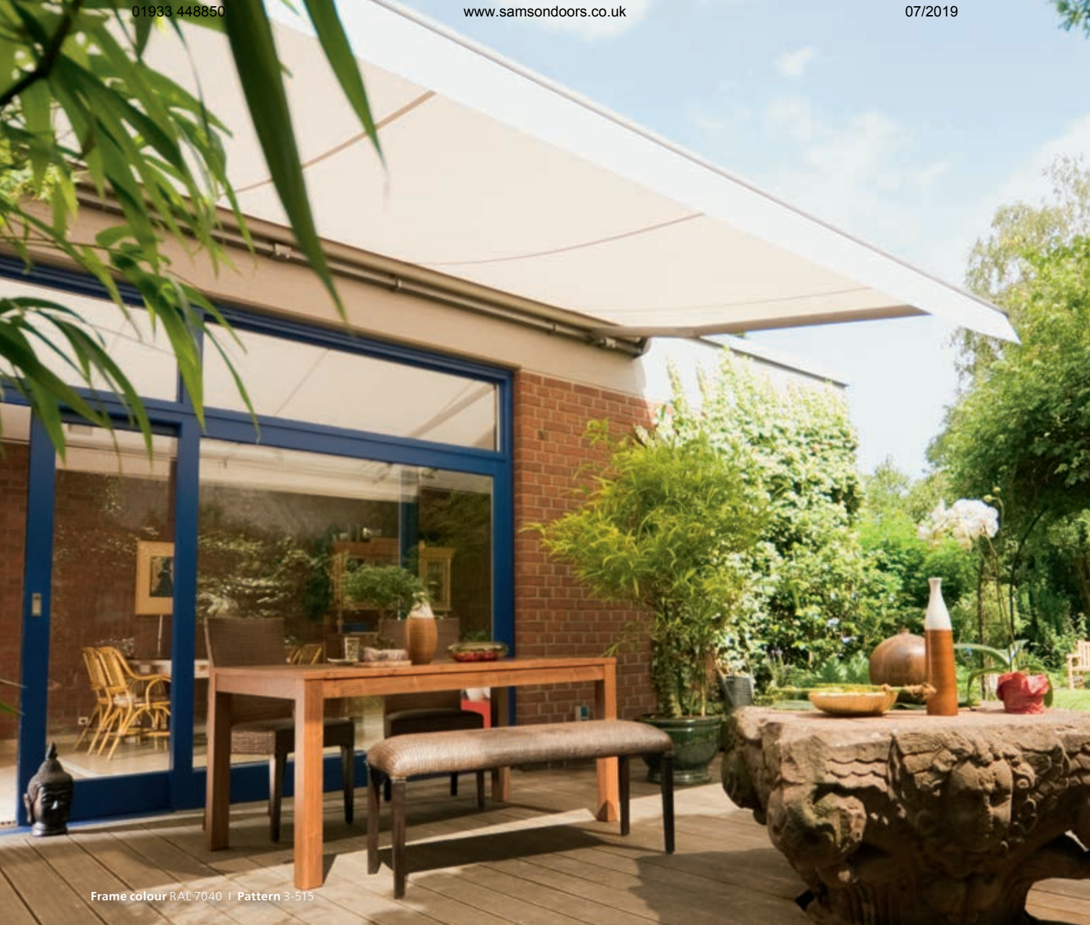
Frame colour RAL 7040 | Pattern 3-515